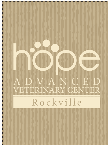
Back of seed packet