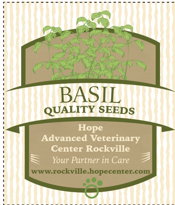
Fronts of seed packets